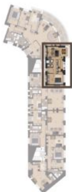
VÝMĚRA BYTU / FLAT AREA