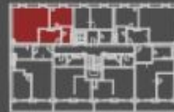
výkaz výměr: (m²) 1 hala 8,7 2 koupelna+wc 4,5 3 ložnice 12,7 4 obývací pokoj + kk 32,5 užitná plocha 58,4 podlahová plocha bytu 41,7