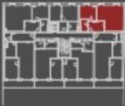
situace bytové jednotky celkový půdorys