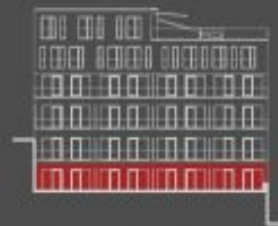
silnice bytové jednotky dvorní pohled