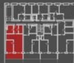
situace bytové jednotky celkový půdorys