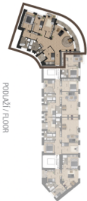
PODLUŽÍ / FLOOR