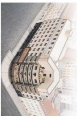
PODLAŽÍ / FLOOR

www.londonhouse.cz , info@londonhouse.cz