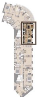
VMĚRA BYTU / FLAT AREA