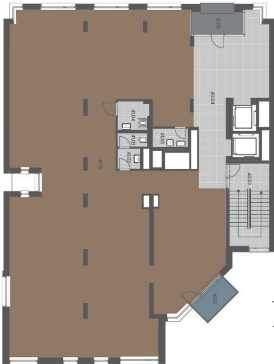
3. patro / 3rd floor