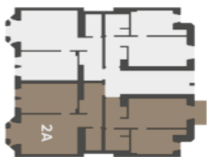
Přidržte podlaží Umístění bytu na patře