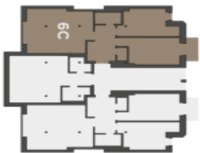
Půdorys podlaží Umístění bytu na patře