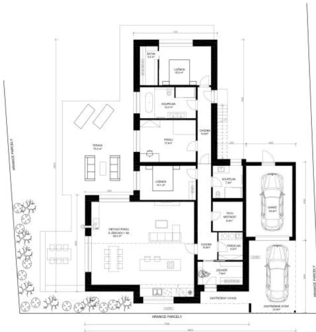
PŮDORYS 1NP - V KONTEXTU PARTERU