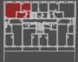
situace bytové jednotky celkový půdorys