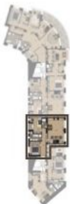
PODLAŽÍ / FLOOR