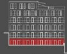
výkaz výměr: (m 2 )

opozornění: Tento je není podrobný shrnutí výzkumu a rozhodnutí uživatele o dohledu nad daty těchto provedení je vyloženo. Počet jednotlivých měření jsou pouze orientační. Vytváření datových souborů v programu Excel, Java, Matlab, R, Python, nebo v jiném softwaru je vyžadováno. Pro další informace o tomto výzkumu navštivte www.itsrc.com .