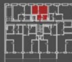
situace bytové jednotky celkový půdorys