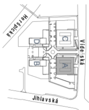
SITUACE / SITE SCHEME