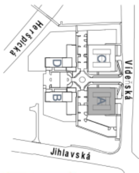
SITUACE / SITE SCHEME