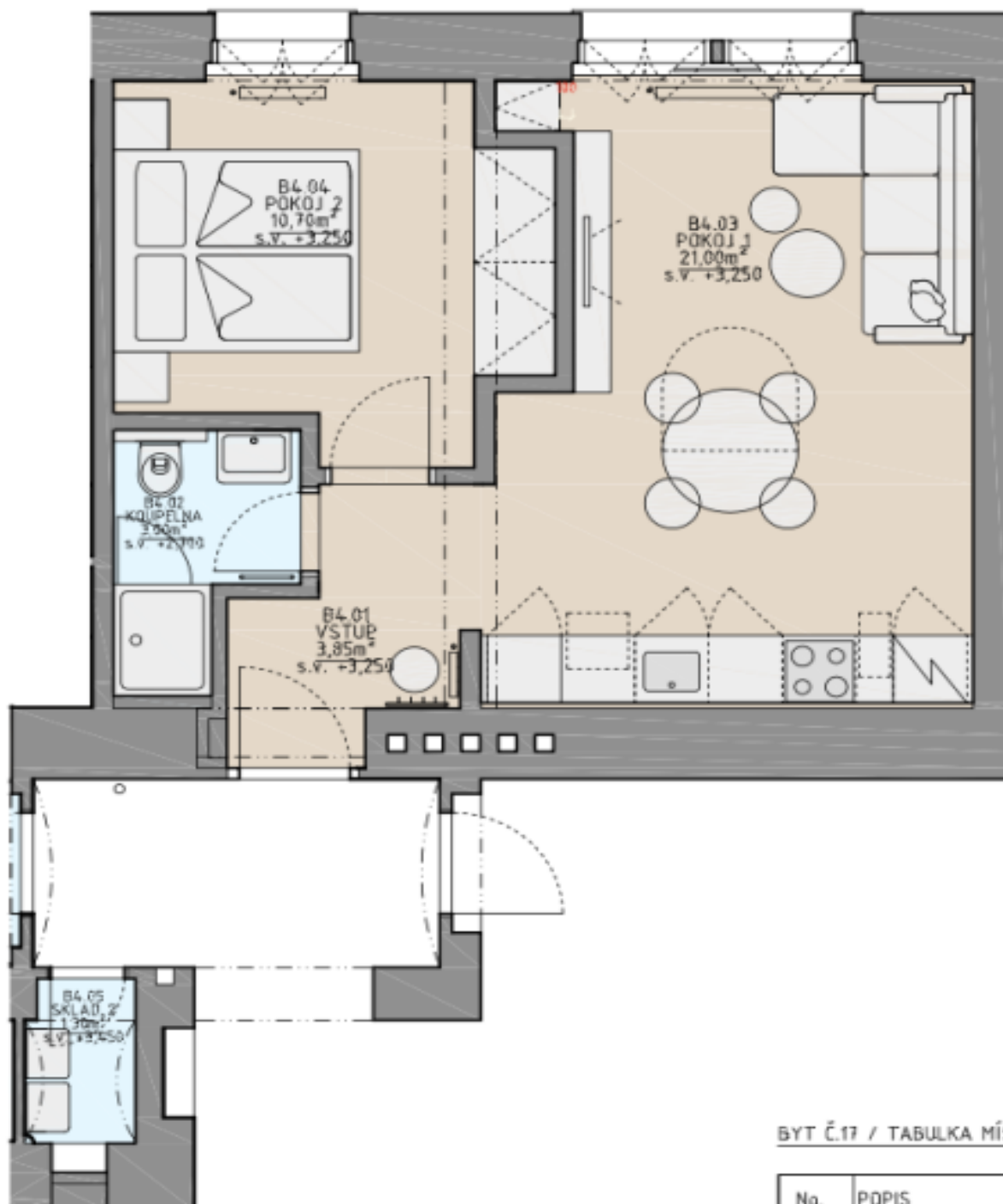
BYT Č.17 / TABULKA MÍSTNOSTÍ

39.85 m 2 , Prague 3, Žižkov, Kubelíkova