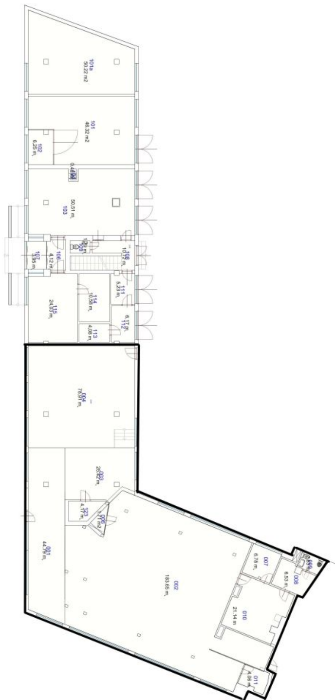
1. NP Objekt A