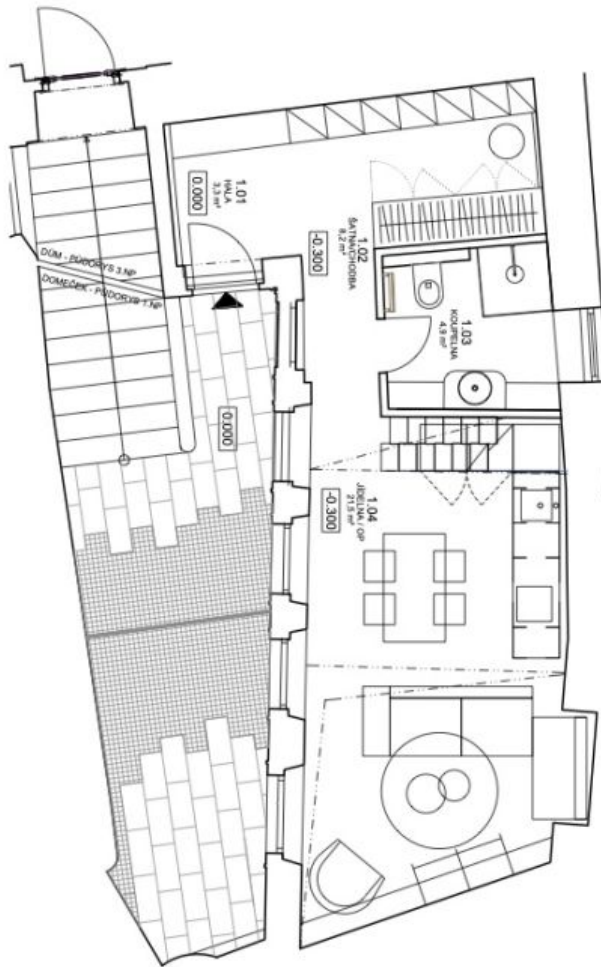
DOMĚČEK - PŮDORYS 1.NP