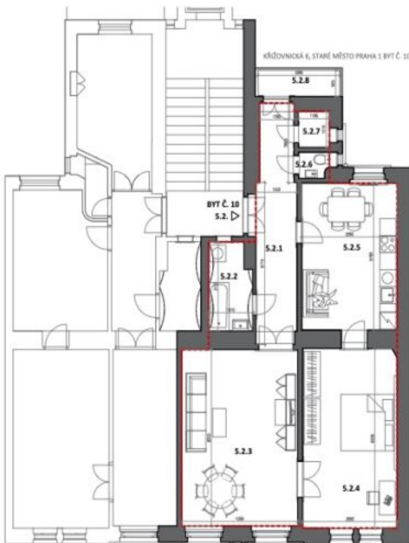
KŘIŽOVNICKÁ 6, STARÉ MĚSTO PRAHA 1 BYT Č. 10 STAVAJÍCÍ STAV

172.3 m 2 , Praha 1, Staré Město, Křižovnická