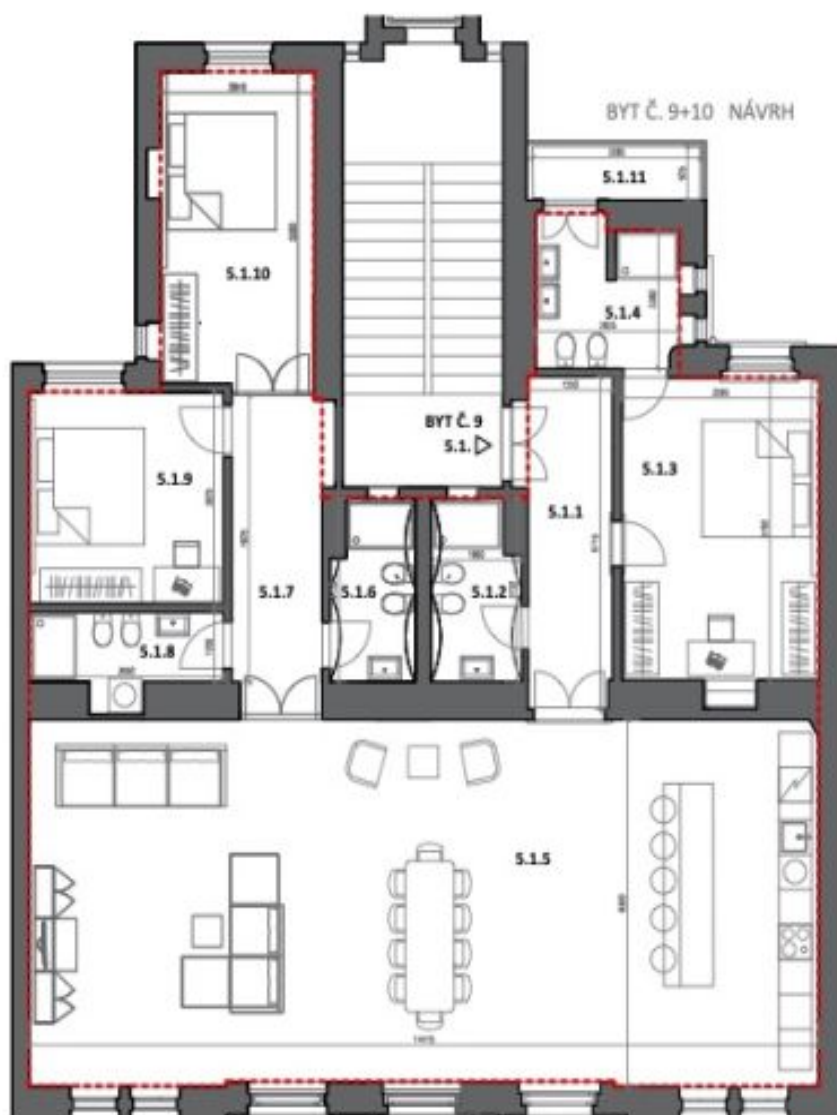
KŘIŽOVNICKÁ 6, STARÉ MĚSTO PRAHA 1 BYT Č. 9+10 NÁVRH

172 m 2 , Prague 1, Staré Město, Křižovnická