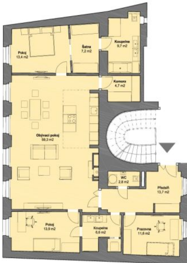
1 : 100 / A4 4.NP