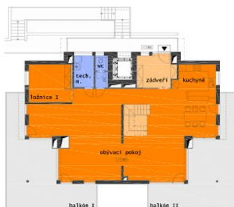
vstupní podlaží 5.np