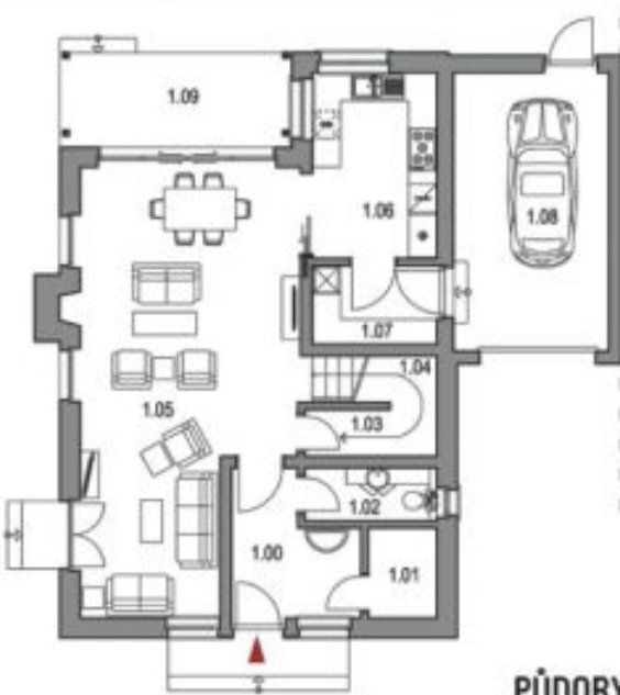
PŮDORYS 1.NP / GROUND FLOOR

plocha domu 156,5 m 2 ( vč. garáže), plocha teras a balkonů 17,4 m 2