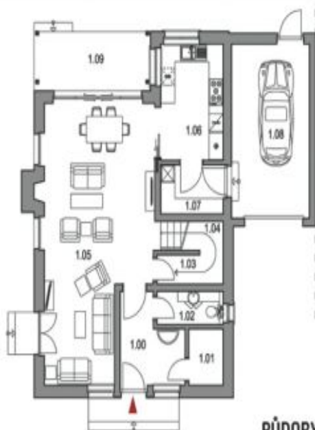
PŮDORYS 1.NP / GROUND FLOOR