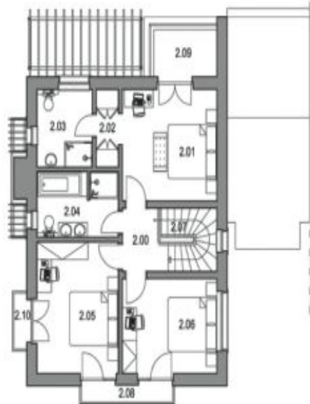
PŮDORYS 2.NP / FIRST FLOOR