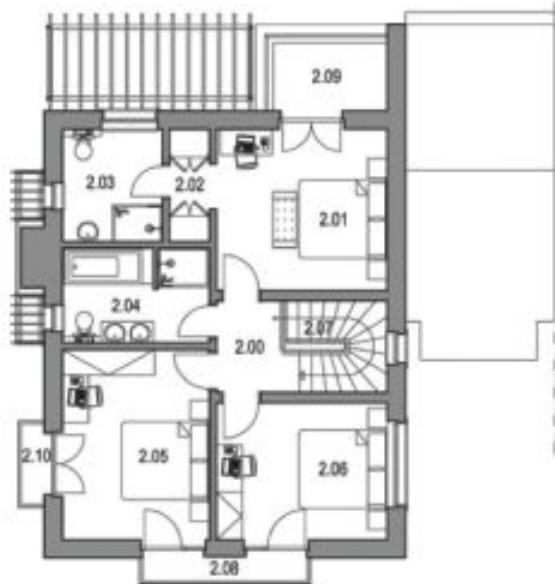
PŮDORYS 2.NP / FIRST FLOOR