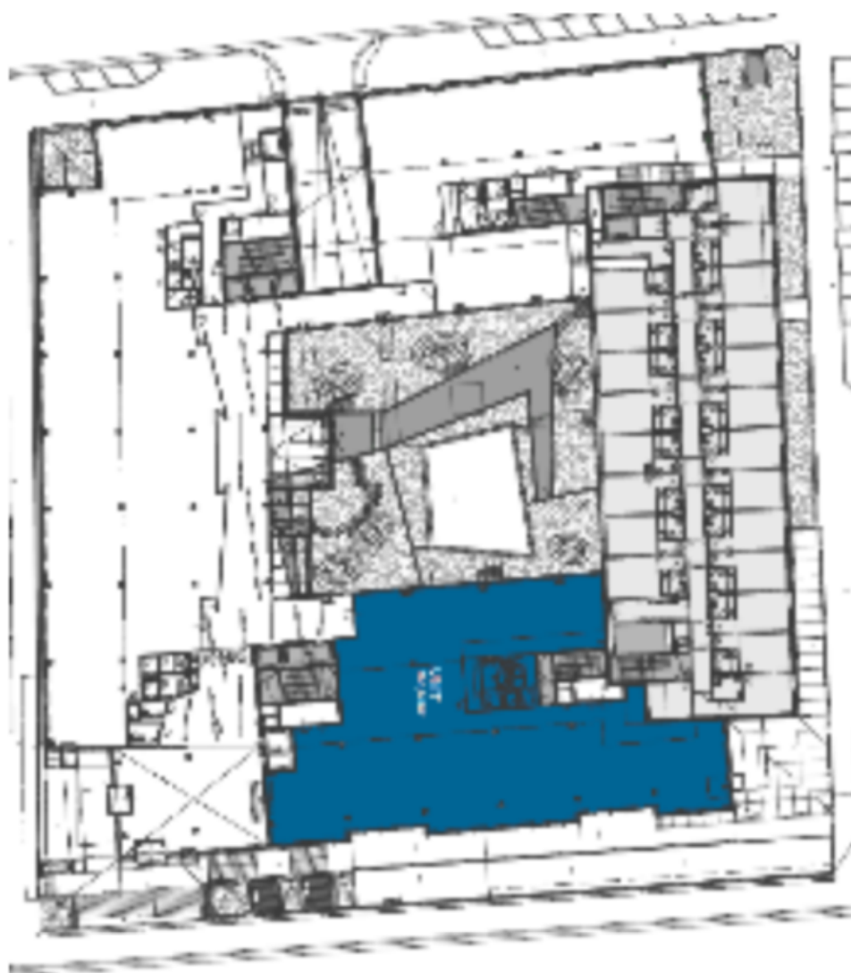
1. patro / 1st floor