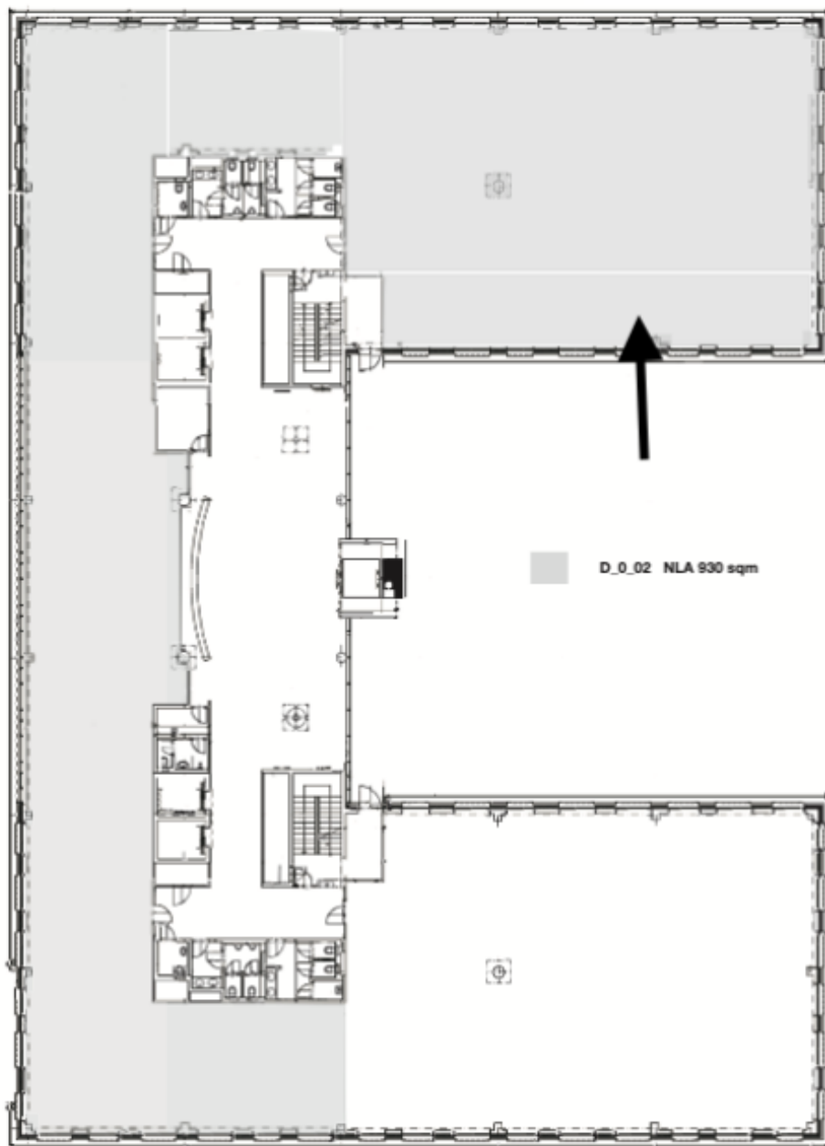
Building D Ground Floor

Copyright © Svoboda & Williams s.r.o. 2024