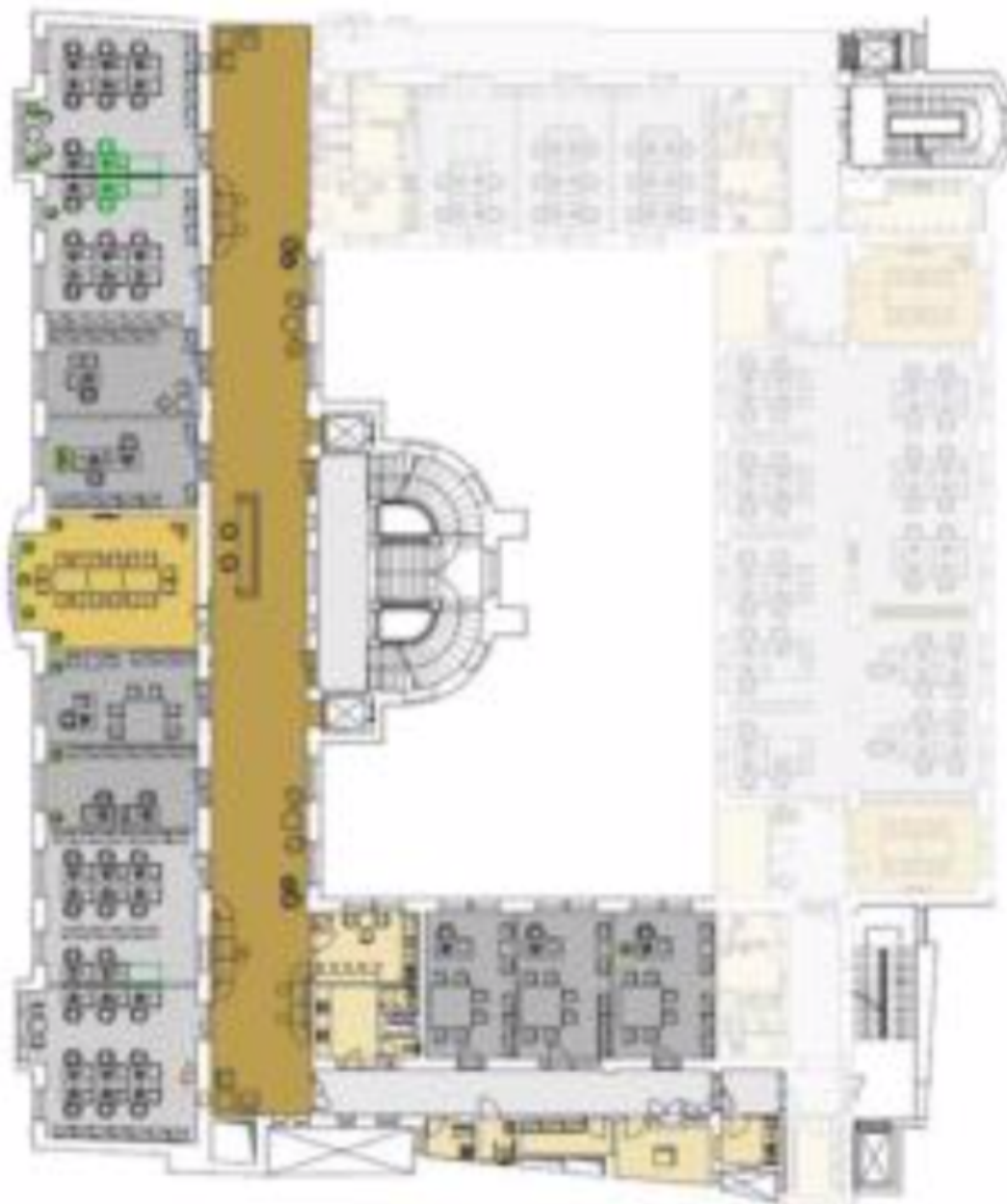
3. patro / 3rd floor