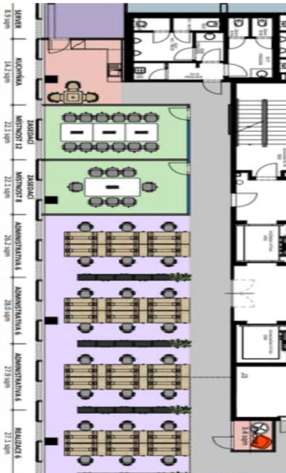
11. patro / 11th floor