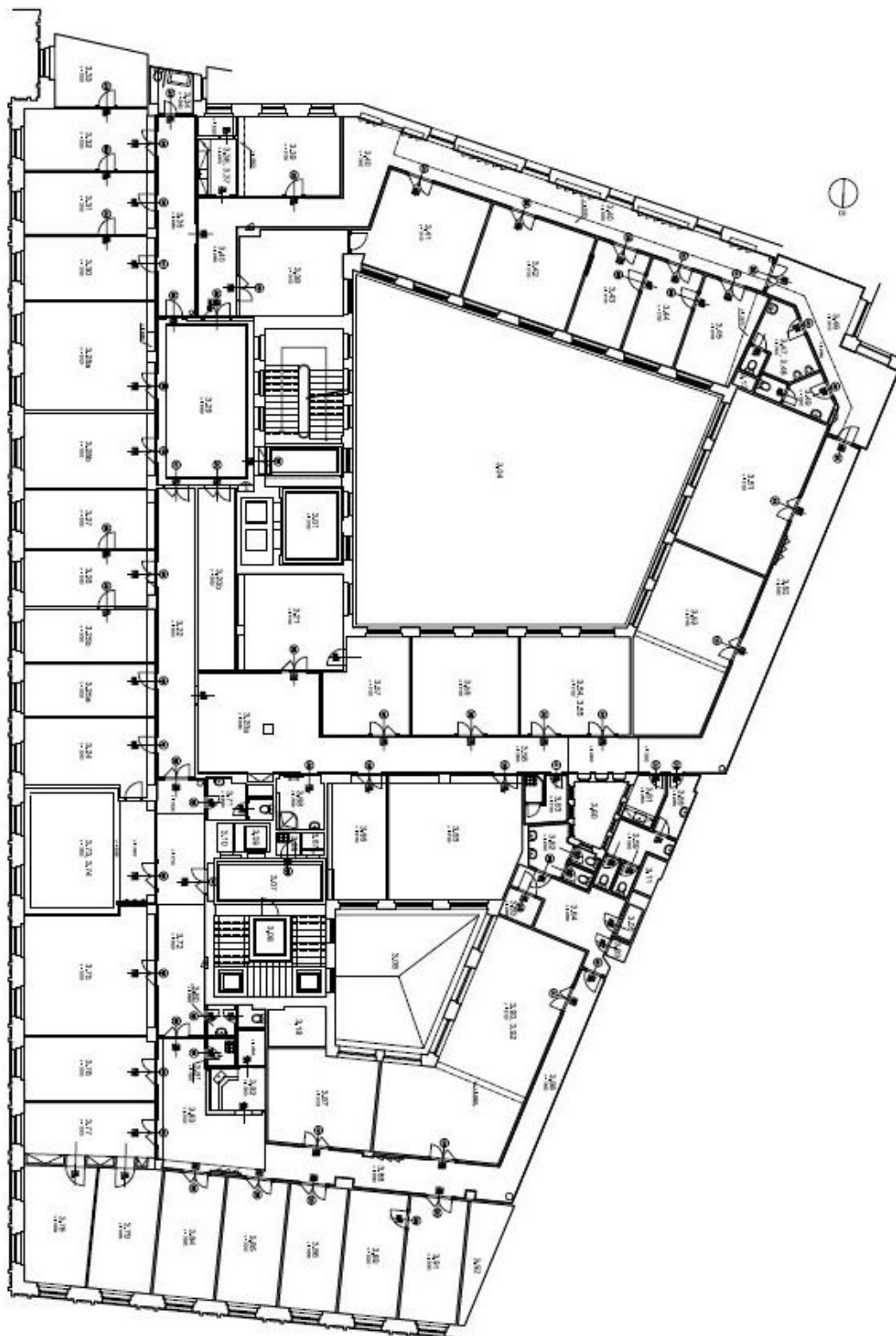
PUDORVY 5.NP (3.PATRO) M 1:100