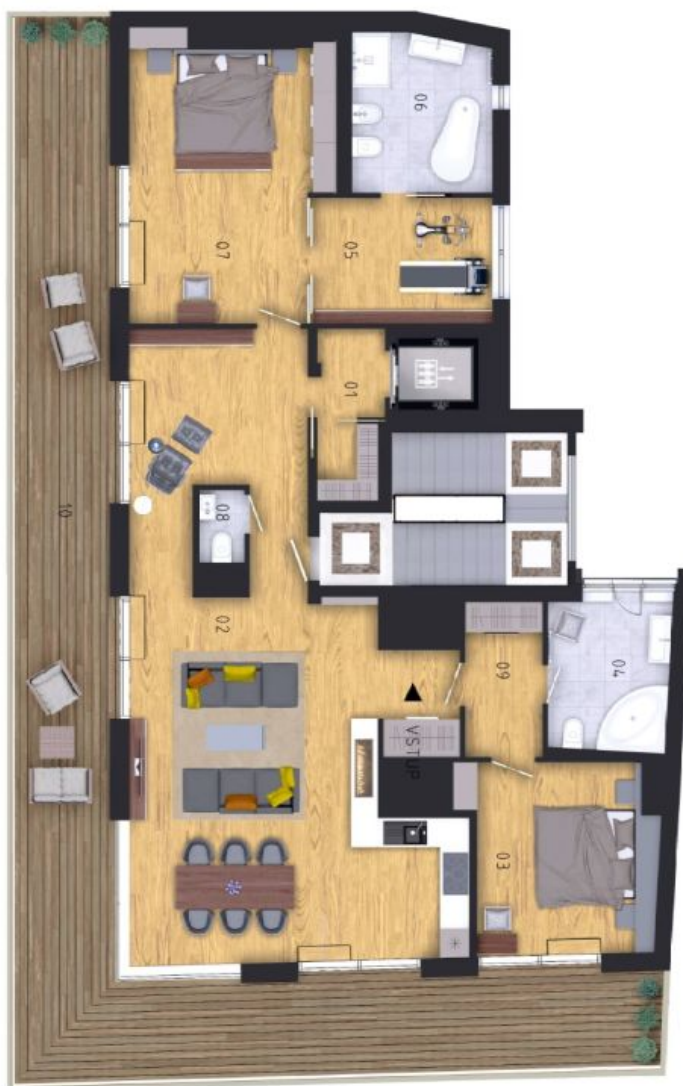
VITRAGE HOUSE BYT 7.19 4+KK