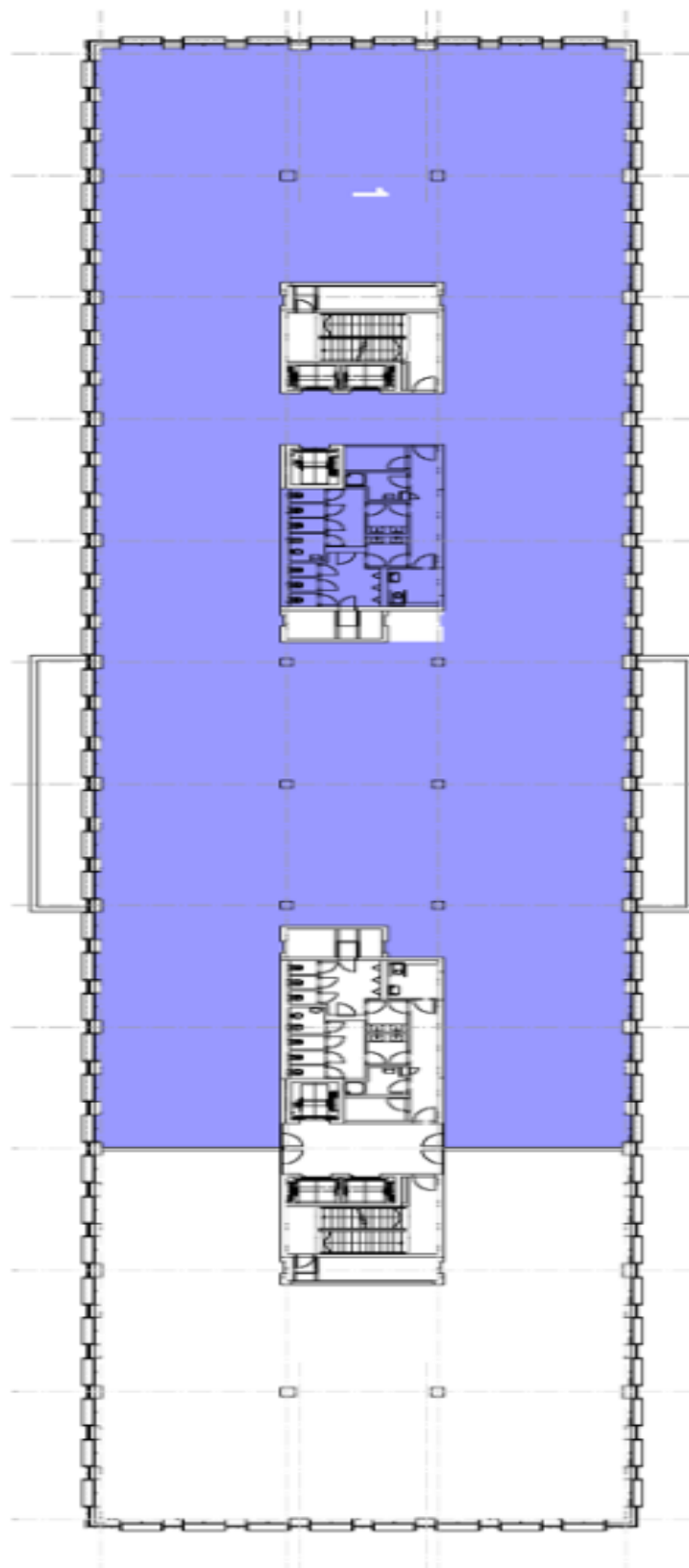
1. patro / 1st floor