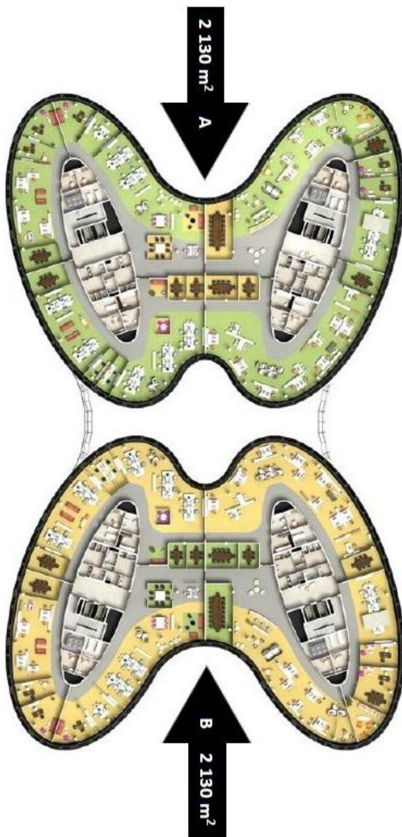
TYPIKÉ PATRO TYPICAL FLOOR