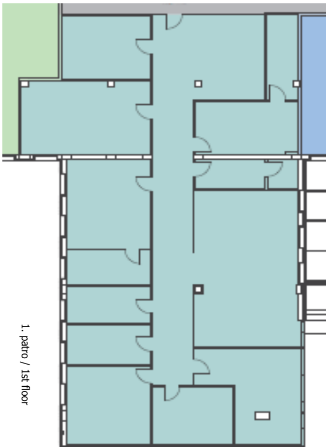
1. patro / 1st floor