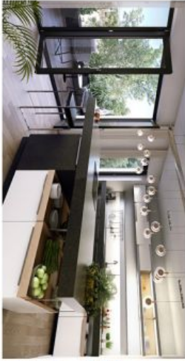
z pohledu Vozova