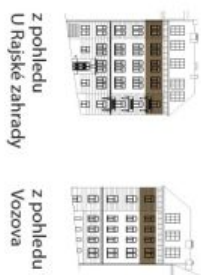
z pohledu U Rajske zahrady