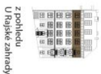
z pohledu U Rajske zahrady