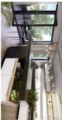
z pohledu Vozova