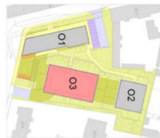
Situace / map