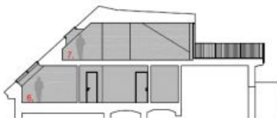
LEGENDA / LEGEND