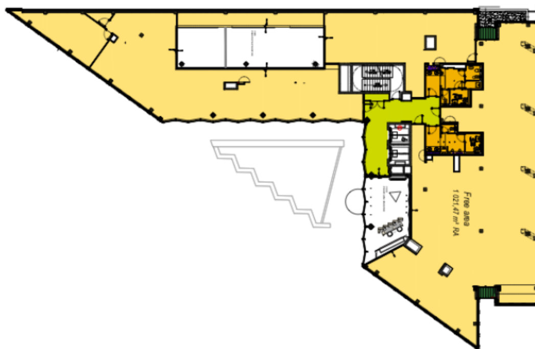
1. patro / 1st floor