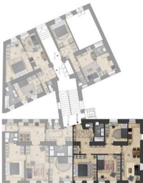
umístění bytu na patře