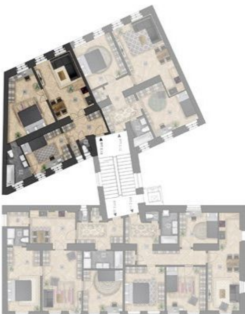
umístění bytu na patře