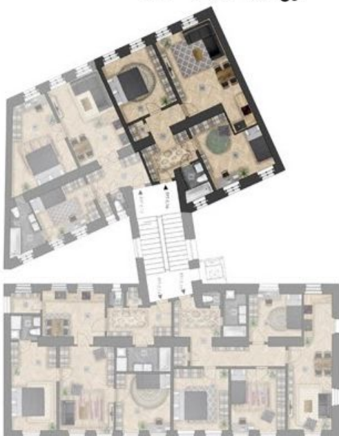
umístění bytu na patře