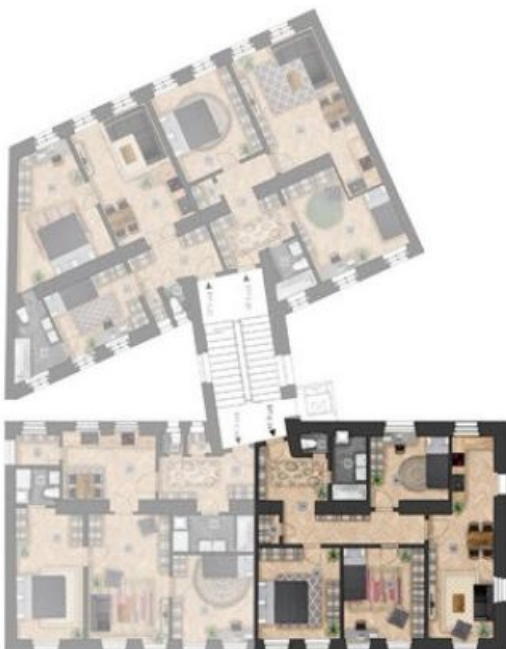
umístění bytu na patře