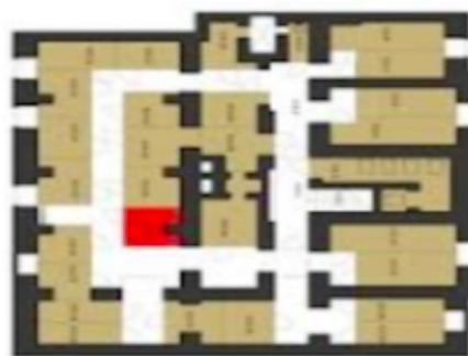
Půdorys 1. PP (sklepy)