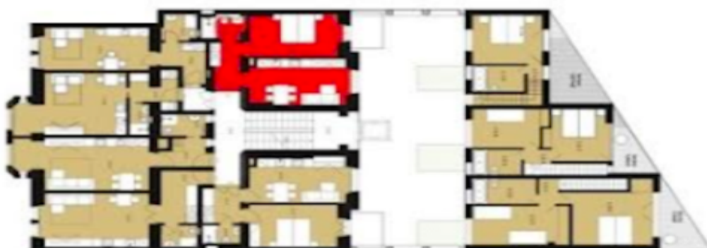
Púdorýs 2. NP