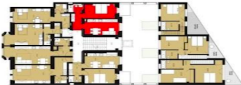
Půdorys 2. NP