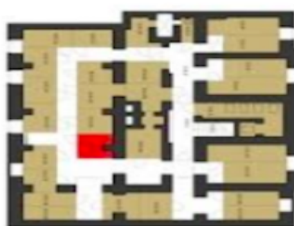
Púdorýs 1. PP (sklepy)