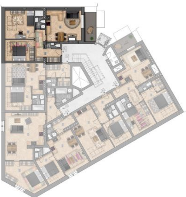
umístění bytu na patře