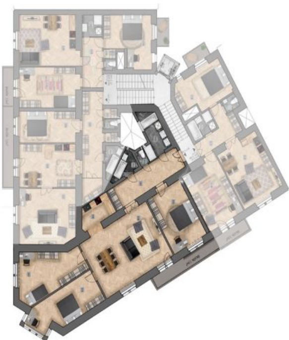
umístění bytu na patře