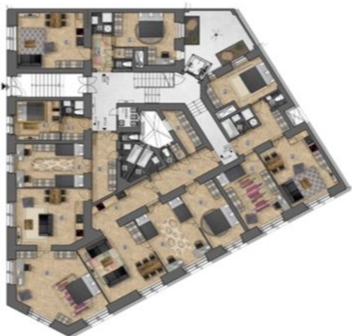
umístění bytu na patře