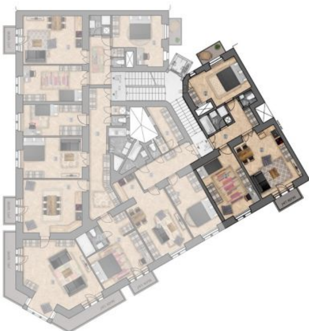
umístění bytu na patře