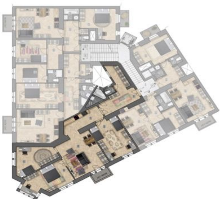
umístění bytu na patře