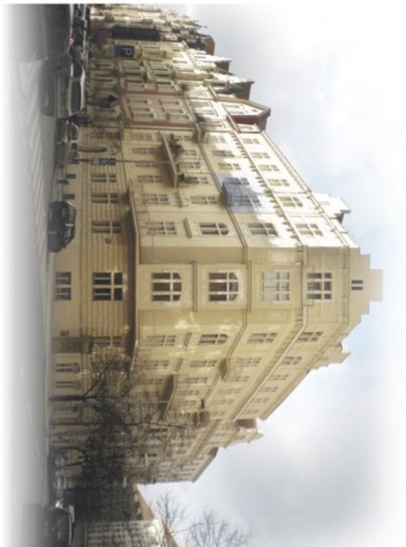
umístění bytu v objektu