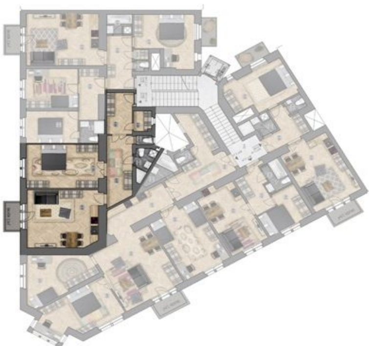
umístění bytu na patře