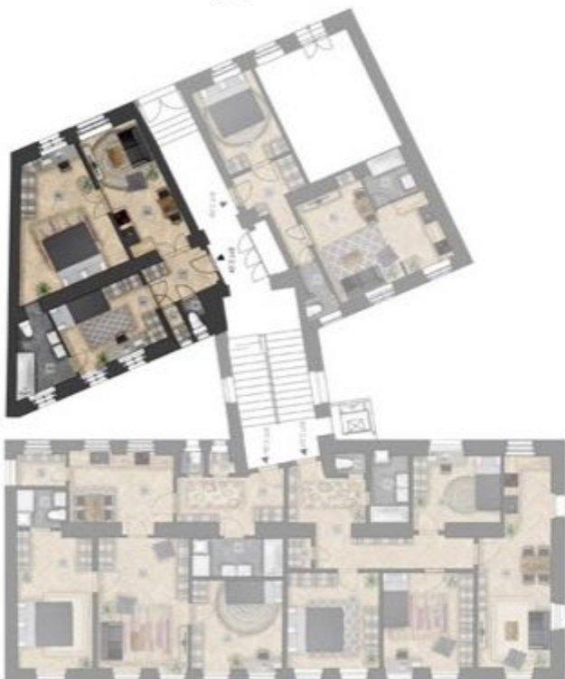
umístění bytu na patře