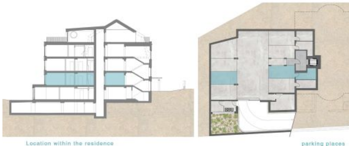
Location within the residence